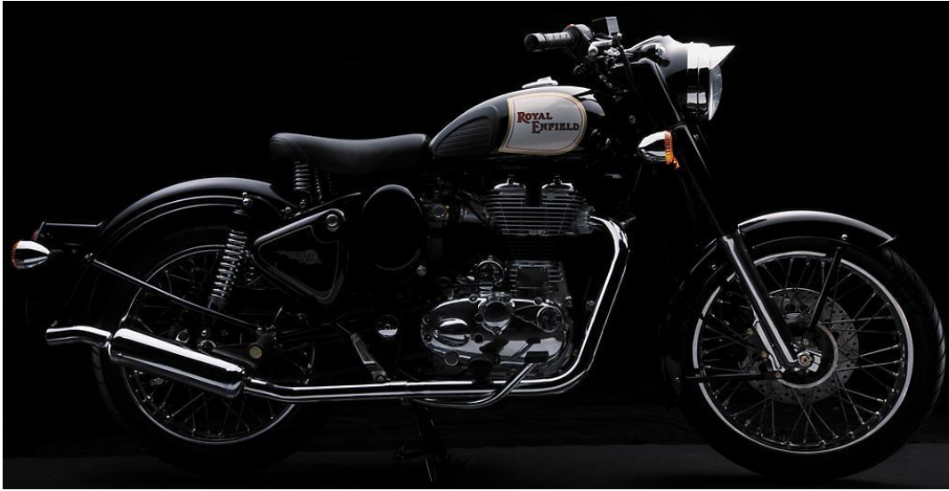
Royal Enfield, makers of legendary British Classic bikes, are back in Cologne, Germany to unveil their all new "BULLET 500" at the Internot.