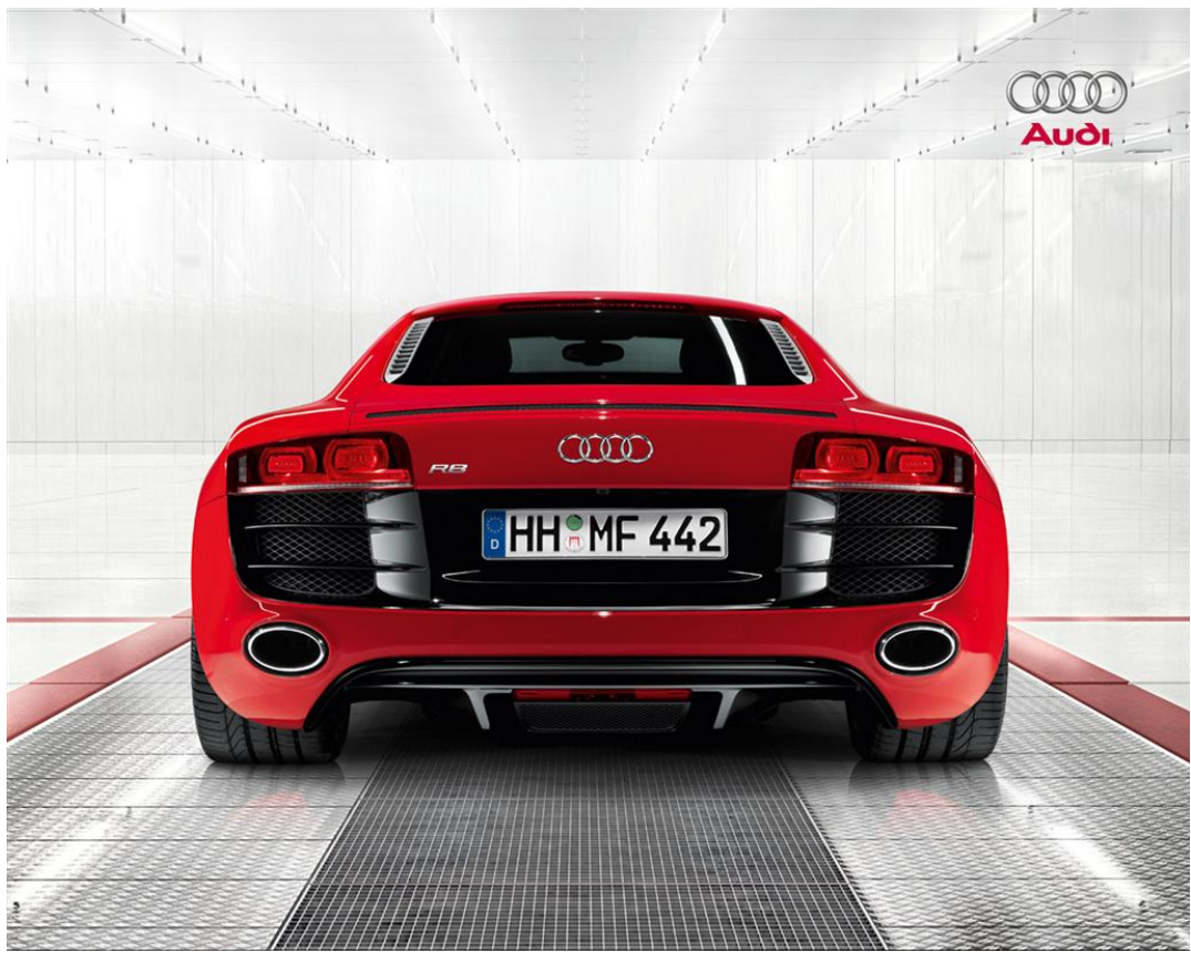
The Audi R8 V10 is mated to either a 6-speed manual or an R-tronic semi-auto that allows it to return an estimated fuel economy of 17 mpg.