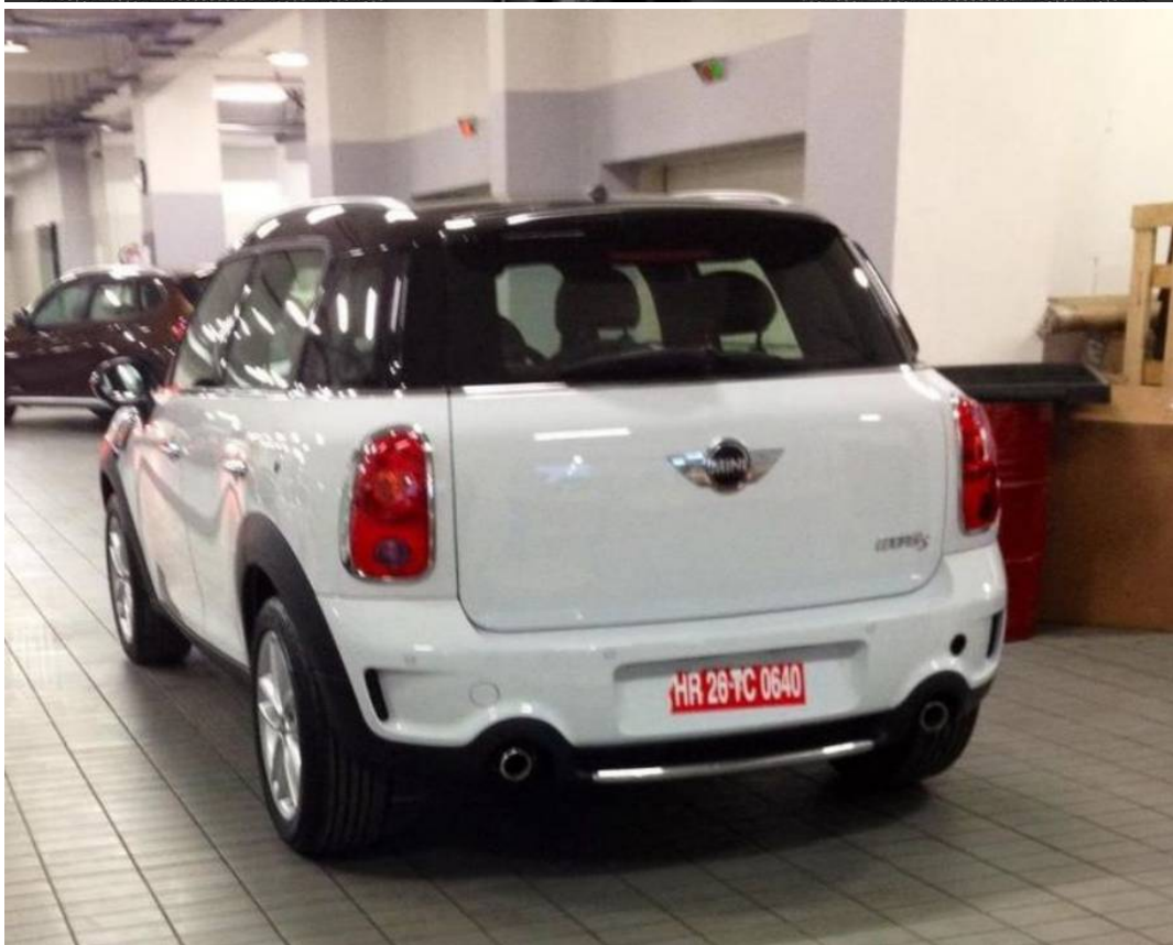
The MINI Countryman S was spied at a BMW Dealership in New Delhi. This 5-door, 4-seater vehicle could be the top of the line MINI on offer for India.