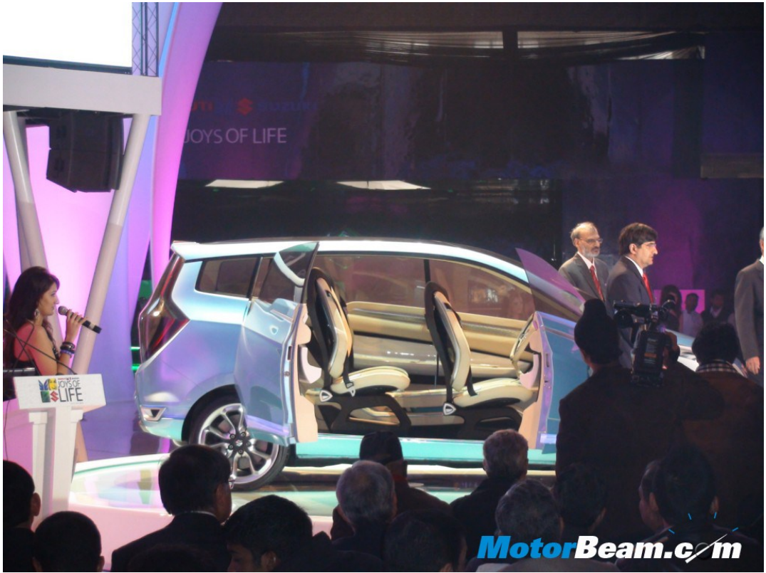
Maruti Suzuki's major attraction at the Auto Expo is undoubtedly the R-III concept. The MPV which has been designed by Indian engineers will go into production in the next 18-24 months. However just looking at the concept we are sure many of the features won't make it into production. Still the concept is drool material. More to follow.