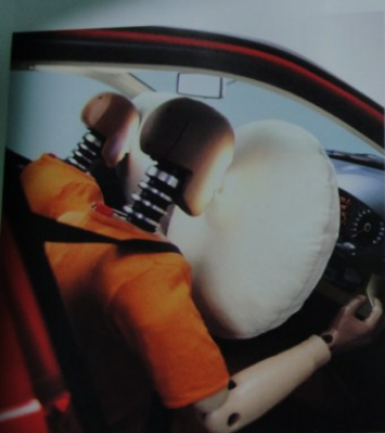
Simply safe: Front airbags for the driver and passenger provides occupant protection for safer journeys.