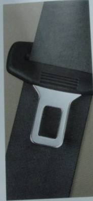
3-point inertia front seat belts are naturally included, providing safety and security.