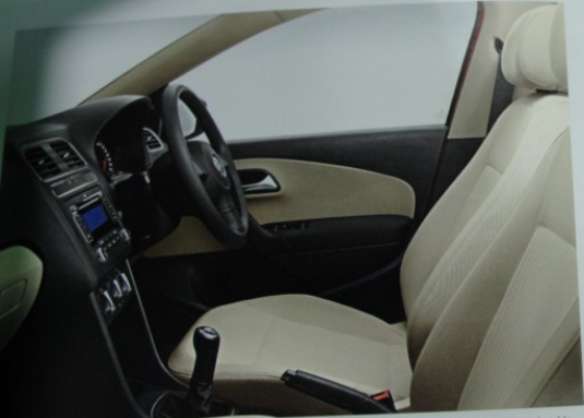
Every Polo driver is different. And with features such as adjustable steering column for both, reach and rake, and perfectly comfortable seats, your car can be as individual as you are.