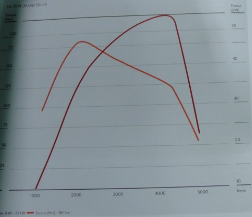
Power & Torque development graph.