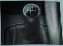
The five speed manual gearbox transmits power with short, accurate shifts and smooth handling makes it easy to use at the right engine speed.

A selection of powerful engine variants means you can enjoy exceptional performance, impressive power and smooth handling together with ground-breaking economy. The new Polo offers a choice of petrol and diesel engines, all designed to deliver dynamic performance. The range starts with a 1.2 litre petrol unit which develops 75 PS (55 kW). This engine promises superior fuel economy without any compromise on power. If it's extraordinary power that you desire, the 1.6 litre petrol engine will surely be to your liking, developing 105 PS (77 kW).