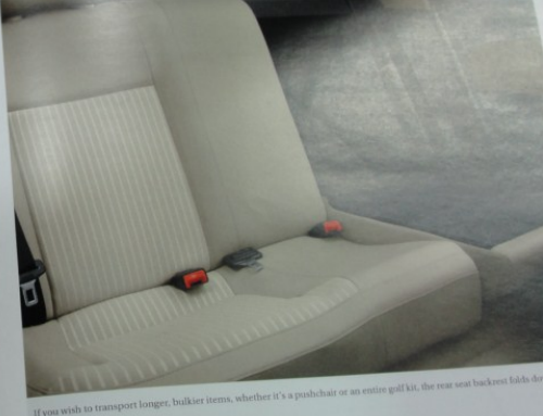
If you wish to transport longer, bulkier items, whether it's a pushchair or an entire golf kit, the rear seat backrest folds down for more flexibility.