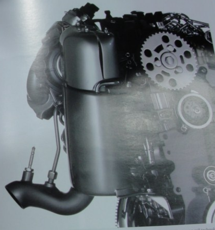
The diesel variant of the new Polo will soon be available in India. Featuring Volkswagen's latest common rail technology, the common rail diesel engine ensures excellent overall performance. The 75 PS (55 kW) unit achieves best in class fuel economy and is incredibly quiet as well.